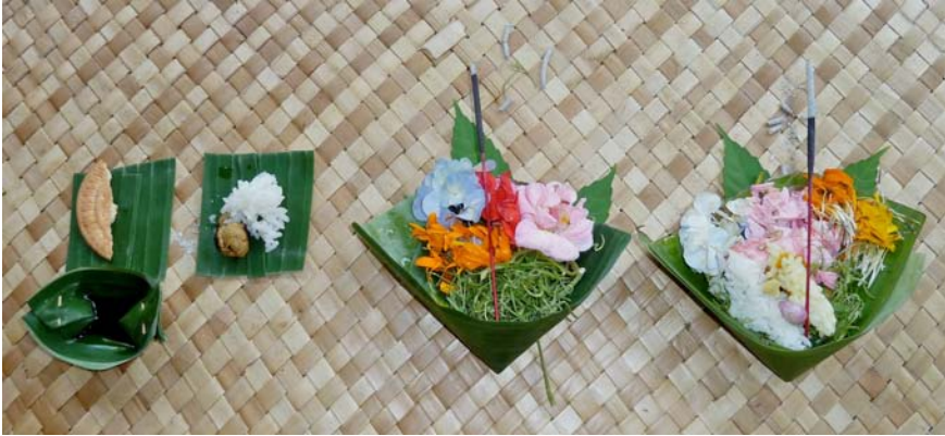
FIGURE 3 Photograph of (1) banten kopi and saiban (left) for sunrise; and (2) canang and segehan (right) for twilight

call tradition), and (iii) accessible to the collective reasoning of a community. 11 What I wish to suggest by these three points is that the kind of variation we have seen with the roadside shrine is not simply a matter of error, or of individual caprice—which brings me to the first of my two points along the way: that, approached as a practice, Balinese offerings are teleologically overdetermined. That is to say, they are at once directed to multiple purposes, or ends, at least some of which are incongruous with one another. I would like to suggest that seeing things this way opens the way for a series of new questions, and so, potentially, a novel approach to the study of that congeries of practices we all too easily like to call ‘Balinese religion’ (see H. Geertz 2000).