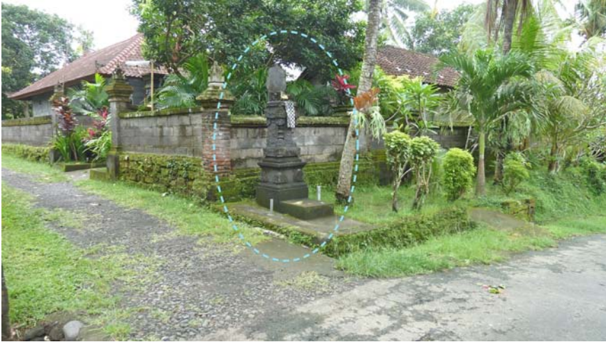
FIGURE 1 Roadside shrine by the outer wall of a houseyard compound at the crossroads

ancestral shrines, but there are also countless little altars strewn along the roads and passageways that run through every town and village on the island.