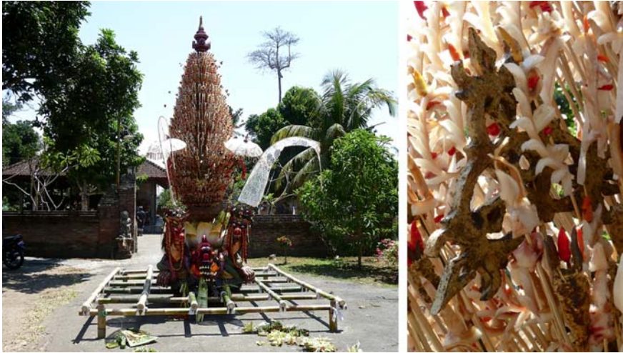
FIGURE 5 The massive saté tungguh offering (left), fitted with the nine directional weapons of the nawasanga; and detail (right) of a 'trident' (B. trisula) shaped from pig fat

for example, to the various forms of baris , but also to the oft-cited 'keris dance'. 19 In a similar vein, much of the generally ceremonial regalia used in the festivals themselves is precisely that of courtly power—lances, daggers, and the related accoutrements of battle. 20